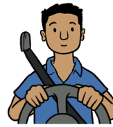
When we're in a car, we wear a seatbelt.