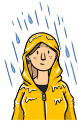
When it rains, we wear a jacket.