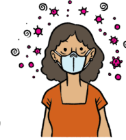
When there's Covid in the community, we wear a mask.

Stay home when we are unwell (with any illness) Or self isolating