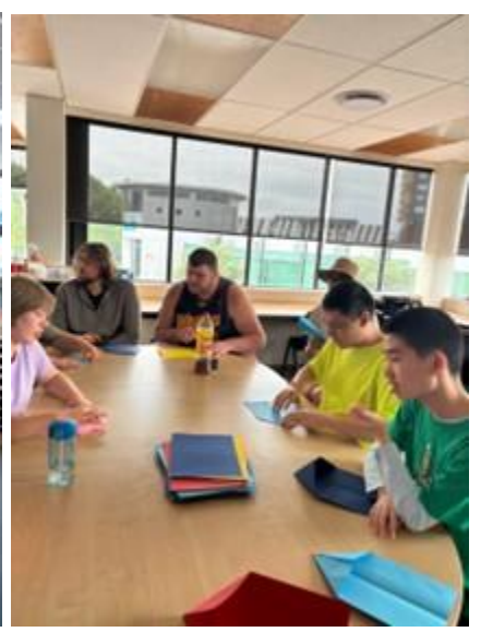
Our ākonga exploring the Aotearoa New Zealand Histories Curriculum.